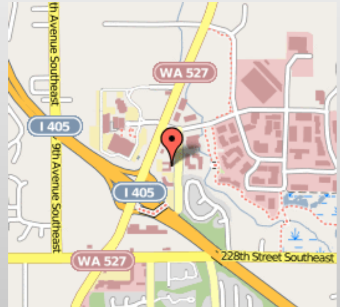
Canyon Park Business Park (Bothell)